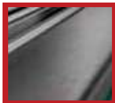
Vacuum Conveyer-belt System