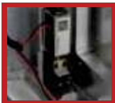
Automatic Height Adjust System