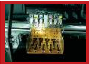
Print Head Carriage