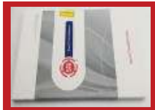
Geniune PP12 Software