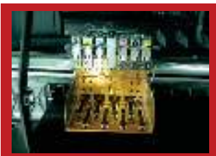
Print Head Carriage