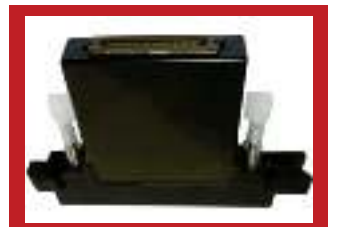
KM 512i Print Head