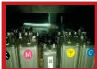
Sub tank Circulation System