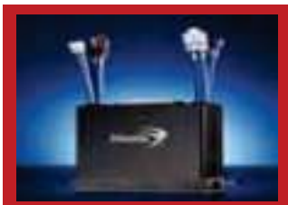
SG 1024 Print Head