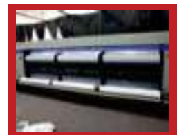
Simultaneous Printing on Multiple rolls up to 3