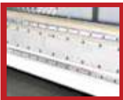
Gold Plated Linear Scale