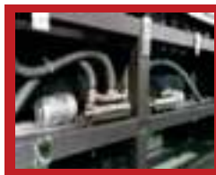
Suction Adjustable System