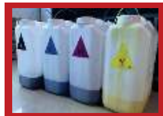
Large Capacity Ink Tank