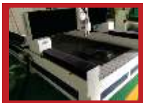
Water Cooling Spindle