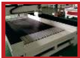
Water Tank bed